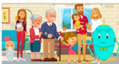
How did taxes come about?