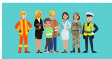
What is tax?