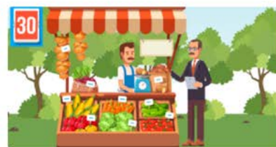
Who pays taxes nowadays?